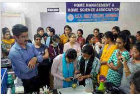
Home Science & Home Mgt. Association