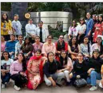
Office Management Association