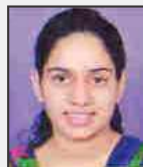
GURNEET JUNE 2019 (ENGLISH)