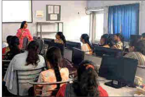
Computer Science Association