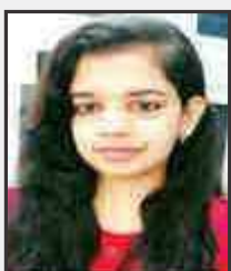
DRISHTI JUNE 2018 (COMM.)