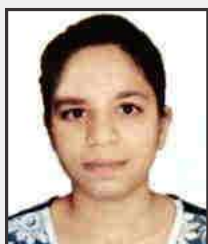
MANGLA JUNE-2020 (COMM.)