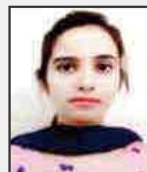
NAVBIT DEC 2019 (COMM.)