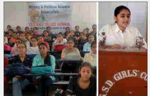
History & Political Science Association