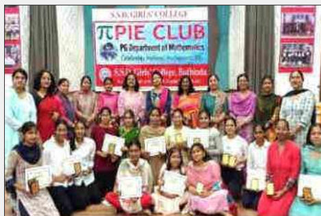
Pie Club of Mathematics