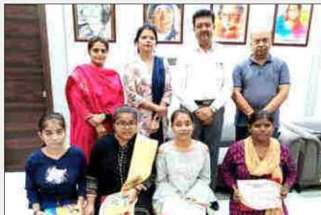
Hindi Sahitya Sabha