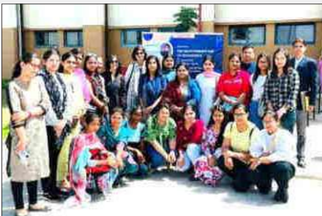
Literary Association of English