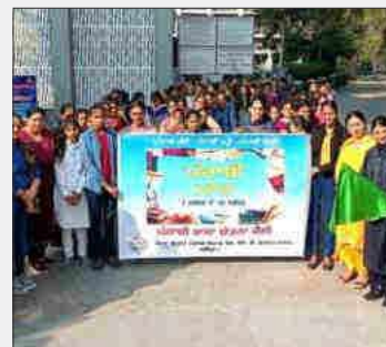
Punjabi Sahitya Sabha